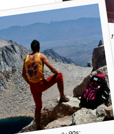
In the early 90s: Climbing action in Mallorca