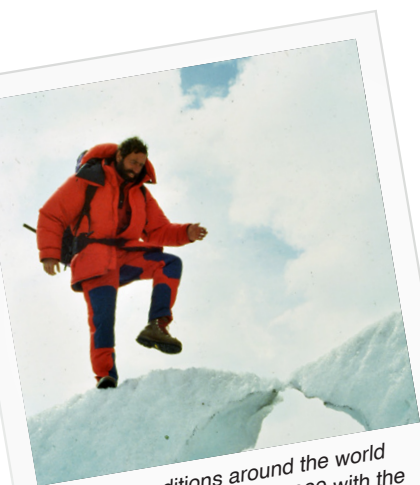
On expeditions around the world since the 80s. Here in 1989 with the Yeti Expedition Down Jacket.

The company thrives as more and more people are drawn to the outdoors. Experiencing new adventures together – that has been firmly rooted in the JACK WOLFSKIN DNA since the beginning. It is natural then, that the product range grows to include, for example, family tents and an expanded children's product line. The community spirit is also the impetus for the organisation of the three-day outdoor and music festival WOLFSTOCK in 2001. Like Woodstock, which in its day symbolised the awakening of a young generation, WOLFSTOCK brings people together who share an attitude to life – and shines a public spotlight on the outdoor movement.